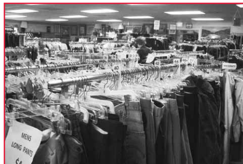
KEEP IT MOVIN'! The Thrift Shop needs volunteers to help things run smoothly.

Now that summer is just around the corner, we say good-bye to our faithful snowbird volunteers as they fly north to cooler climes! Until their return this fall, the Thrift Shop operates with a very thin team. We are eager for summertime volunteers, like High Schoolers who would like to earn public service hours towards a Bright Futures Scholarship, or folks between jobs who want to add to their resume. The shop is open 10-4 Monday through Saturday but volunteers can set their own schedules. There are always clothes to hang, items to be priced and shelved, electronics to be checked for working order and many other light work duties. Come join our team at the shop, meet some fun folks, and contribute a little of your time and heart to a worthy organization. Hope to see you soon! To volunteer, call Daily Bread Thrift Shop at 321-676-2900.