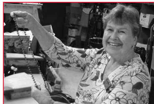
A cheerful volunteer sorts items for display.