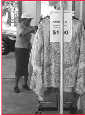
Bargain Hunter! Nice day to shop the outside racks at Daily Bread Thrift Shop.

Non-Profit Organization U.S. POSTAGE PAID Melbourne, FL 32901 Permit No. 239