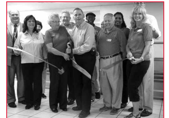
SNIP! The moment captured perfectly!